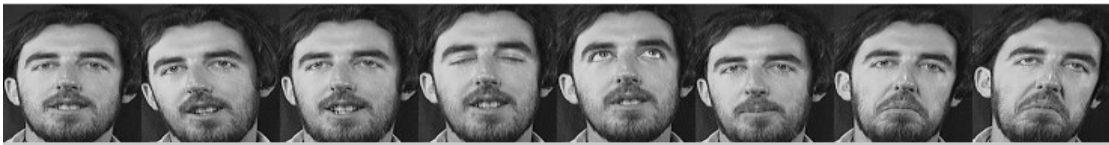
Fig 4. Sample faces from ATT Dataset