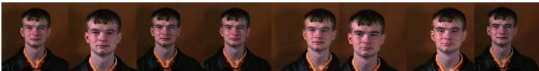
Fig 6. Sample faces from Faces95 Dataset