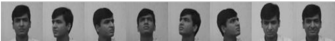
Fig 5. Sample faces from IFD Dataset