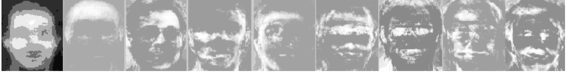
Fig 1. Sample eigenfaces

That maximizes \text{tr}(U^T C U) . This leads to an eigenvalue problem C U = U \Lambda where \Lambda = \text{diag}(y_1, y_2, \dots, y_k) is the matrix of eigenvalues of C . Now the eigenfaces matrix can be used to recognize the new faces such that the face x is similar to the face x_b where \|U^T(x - \mu) - U^T \delta_b\|^2 is the minimum.