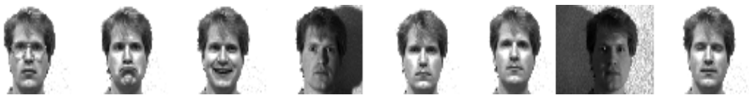
Fig 7. Sample faces from Yale Dataset