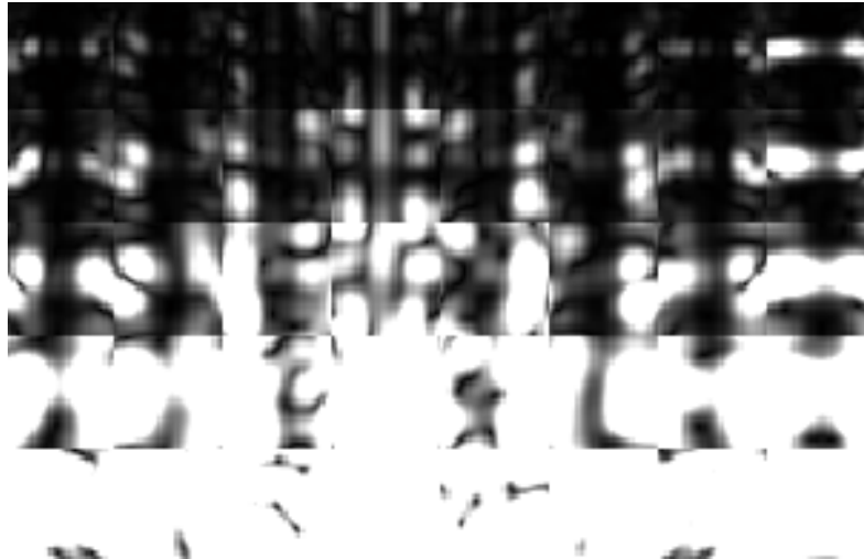
Fig 3. An image from ATT dataset after step 3.d is applied